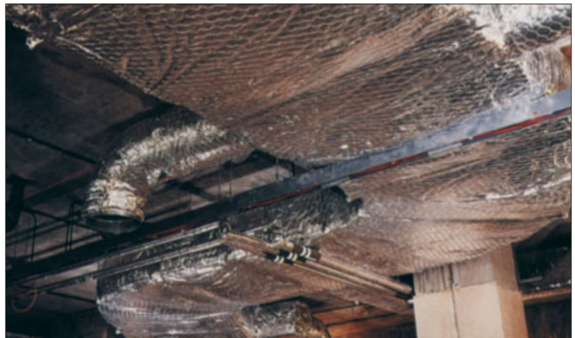
Rockwool Ductwrap used to thermally and acoustically insulate ducting

The nominal density of Rockwool Ductwrap and Ductslab is 45 kg/m 3 .